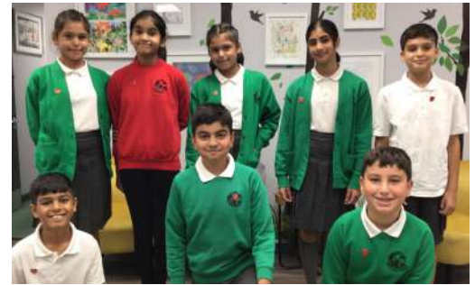
Congratulations to our new, recently elected School Council.

The Solihull Approach: NHS Leicester, Leicestershire and Rutland have partnered with the Solihull Approach to offer free online courses. These have been put together by psychologists and healthcare professionals to support families in understanding your child's feelings. The courses are not about teaching you how to be a parent; instead they will give you a framework for understanding what might be going on and space to think about how you want to respond. There are a range of courses for different aged children and the courses are available in different languages. Click here to find out more.