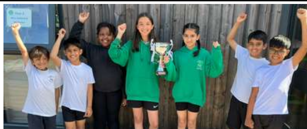
Sports Day Champions!